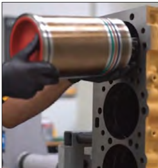
Con Rod Kits

Reduce your machines' down time by using CTP CON ROD Kits