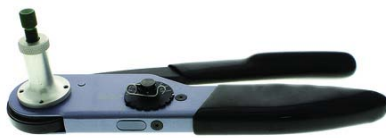
1U5804* Crimp Tool

The CTP Terminal Connector Kit comes conveniently packed in a special protective suitcase that brings over 236 pieces.