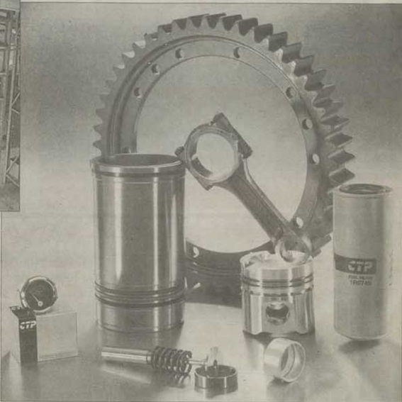
Costex offer a wide range of parts.