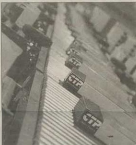
CTP products move down the line ready to be shipped out.

Among the constant challenges in the parts business is the